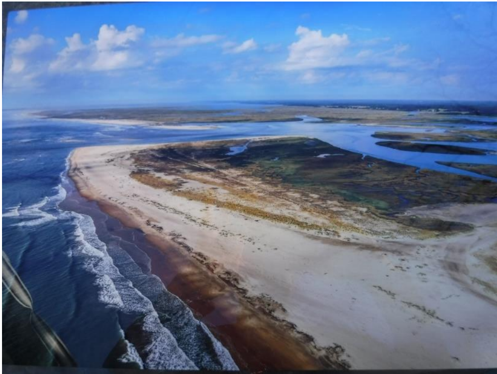
Metompkin inlet and Cedar Island.